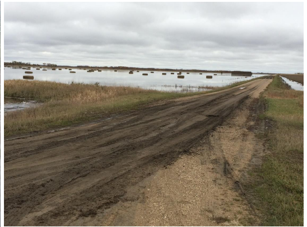
Looking SE at Section 6 Barto Twp – photo taken from NW corner of the section. Diversion will extend 4 miles south from this location